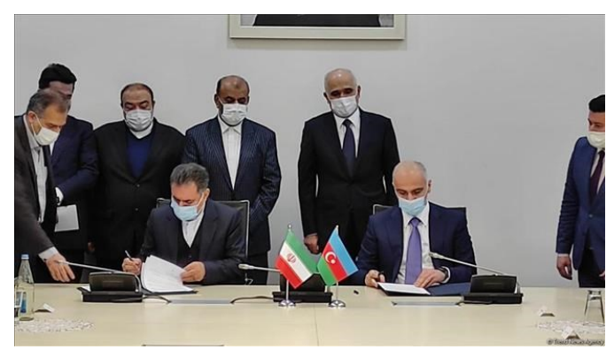
BRIDGE OVER ASTARACHAY

Iran and the neighbor Azerbaijan have signed a memorandum of understanding (MOU) for cooperation in constructing a bridge over the Astarachay border river, the portal of the Iranian Transport Ministry reported.